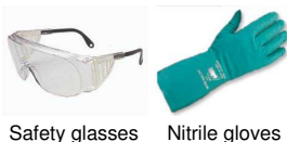
Safety glasses Nitrile gloves